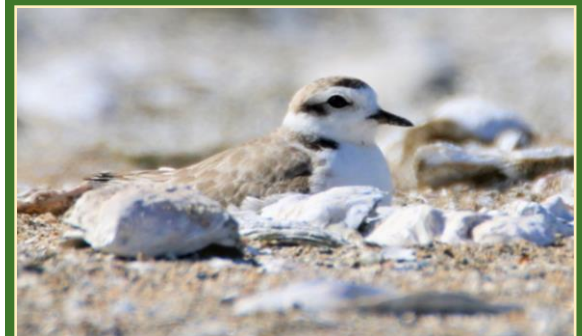
Nesting Western Snowy Plover.