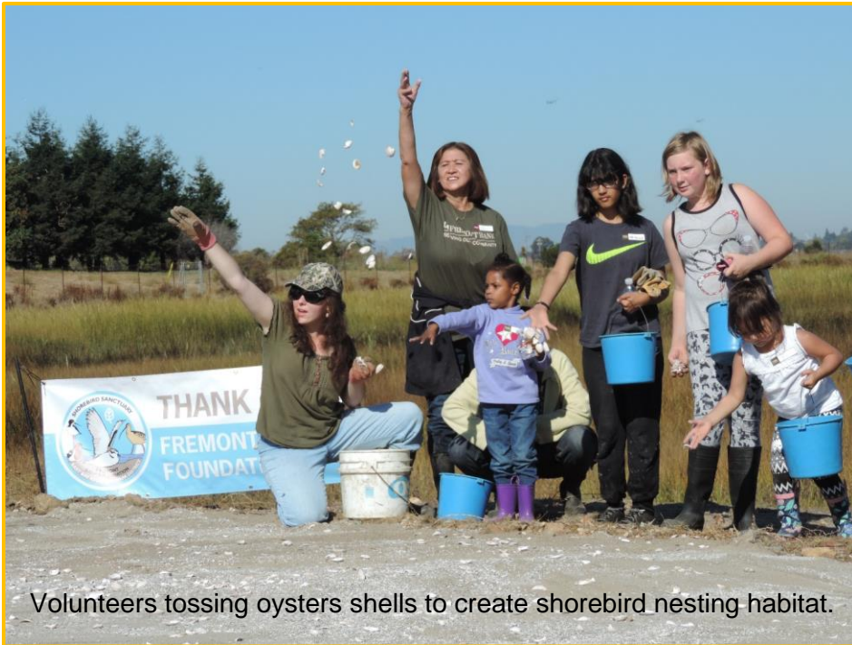
Volunteers tossing oyster shells to create shorebird nesting habitat.

People of all ages are working to create nesting habitat for the federally threatened Western Snowy Plover. By helping to pull weeds, move bulk sand and oyster shells, we are crafting ideal courtship conditions for breeding plovers, avocets, stilts and other shorebirds. The tidal marshes of Martin Luther King Jr Regional Shoreline, in Oakland, are very productive feeding and resting places for thousands of migratory shorebirds, waterfowl, grebes and terns.